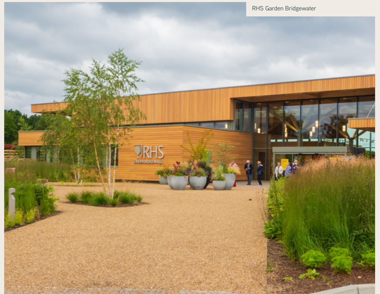
RHS Garden Bridgewater