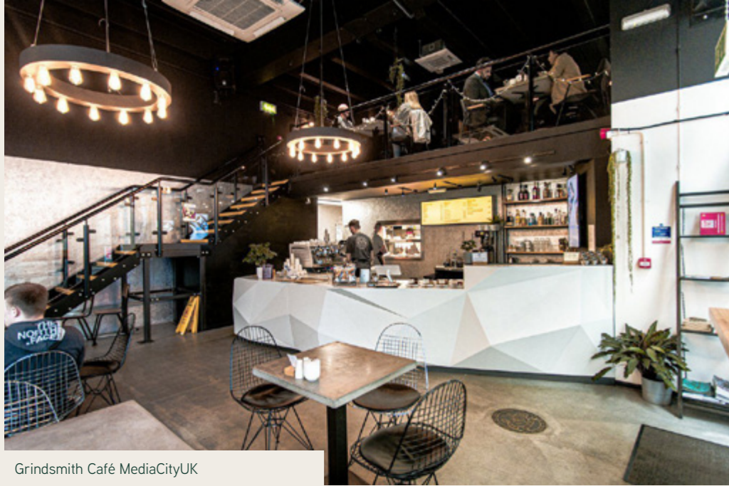
Grindsmith Café MediaCityUK